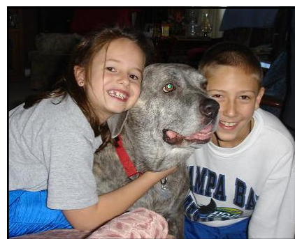
Dawn loves her new family!