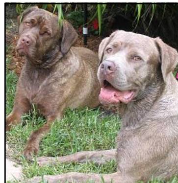
Contessa enjoying the yard with her foster brother Caesar